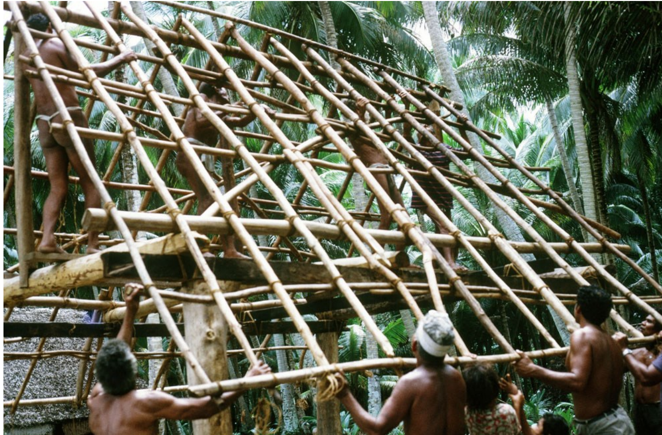
Tobi Island 1972: Santos's New Roof

Since then Horofati braces have made thatch roofs very strong!