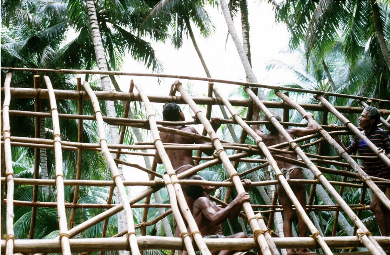
Tobi Island 1972: Santos's New Roof

Horofati is the name of the cross brace that is part of the framework under the thatch on a roof.