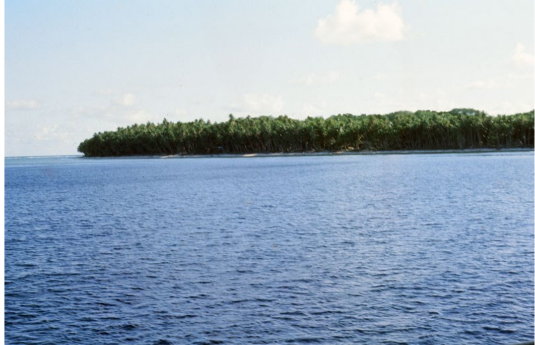
Tobi Island South End, 1972

Horofati continued to travel and reached another island.