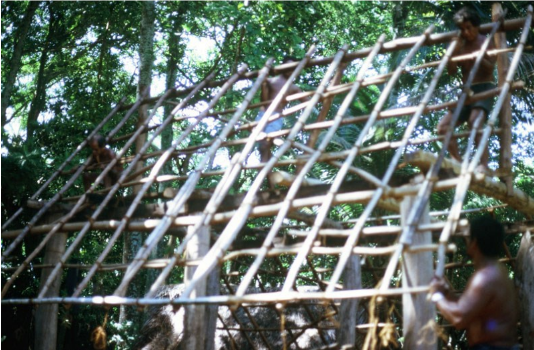
Tobi Island: Moving Santos's Roof

There he saw some old men making a canoe house.