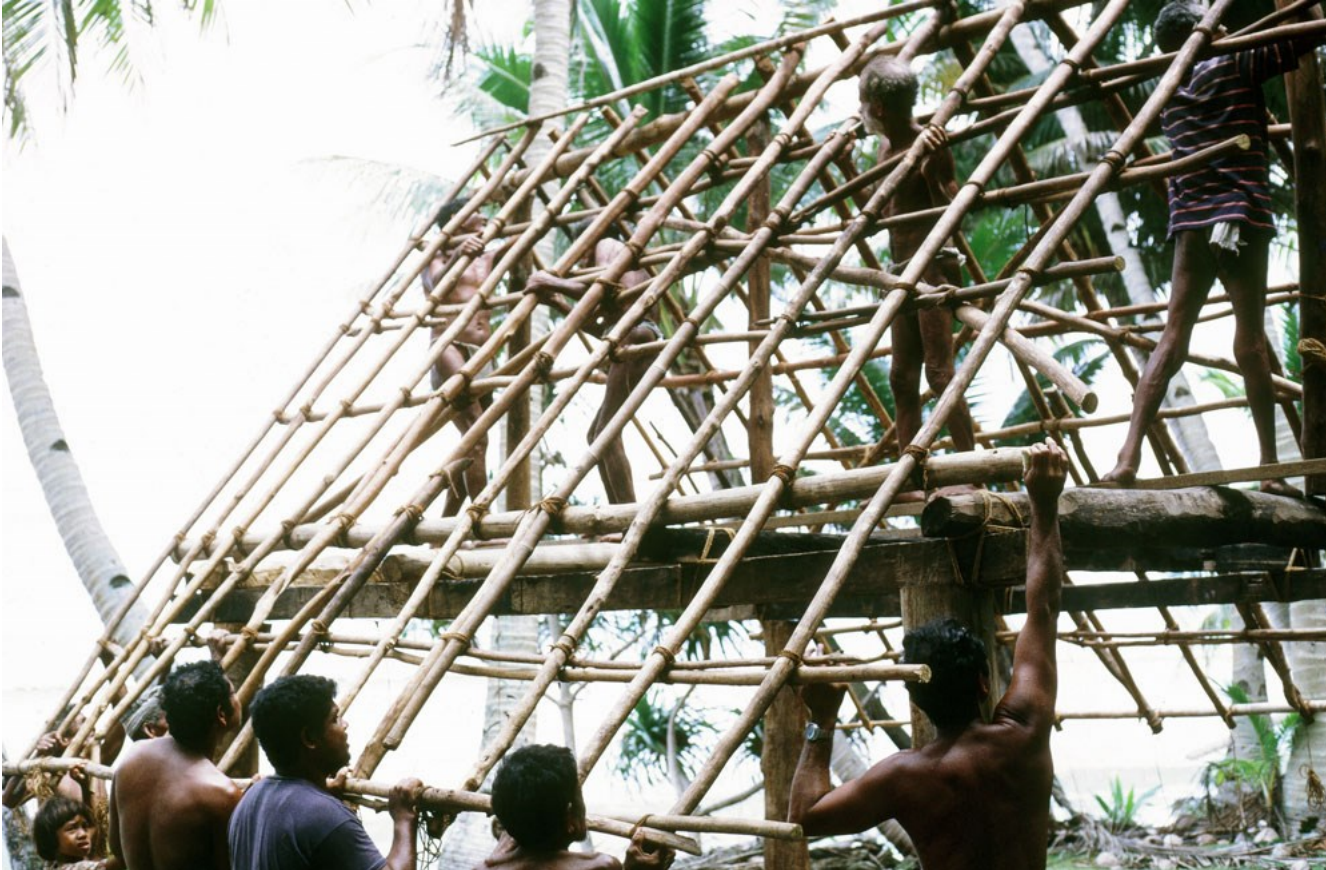
Tobi Island 1972: Santos's New Roof

They help to hold the whole roof together.