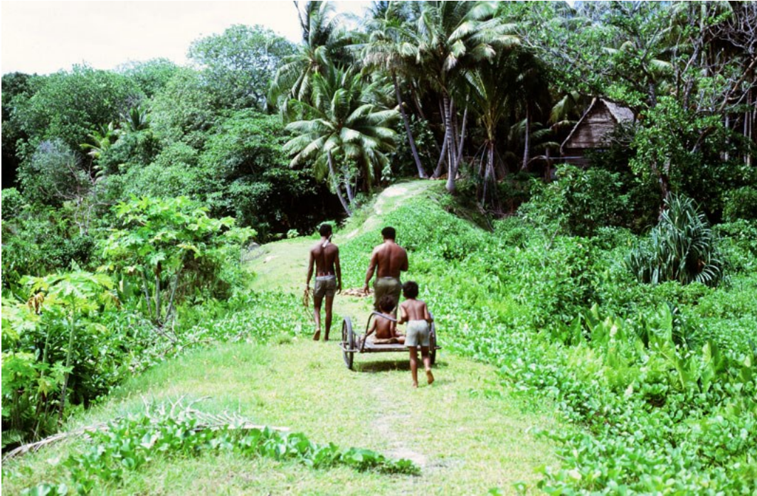
Tobi Island cross-island path 1972

Now Horofati said to them, “Come with me to the forest and I will get my poles.”