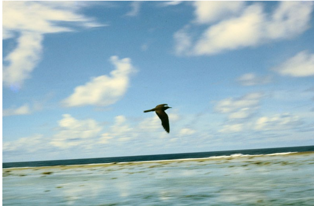
Tobi Island, Northwest Reef, 1972

When Horofati was walking on the reef, he looked down and saw an open clam.